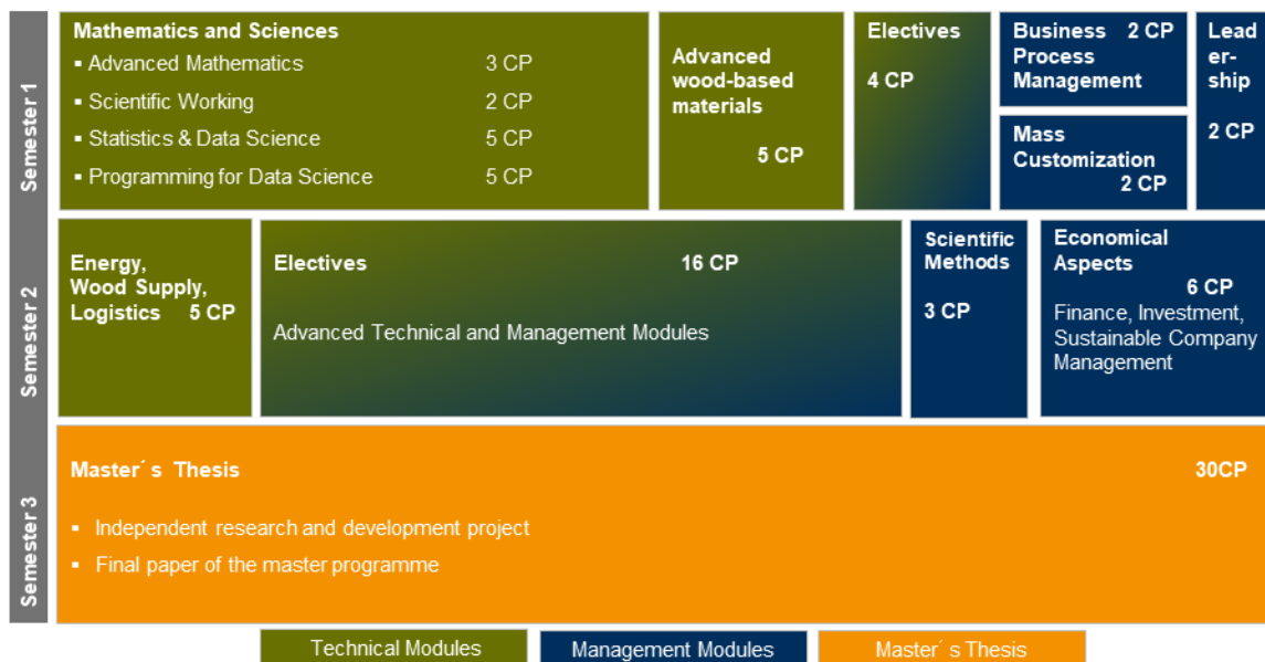
Fig. 1: Schematic representation of Programme structure