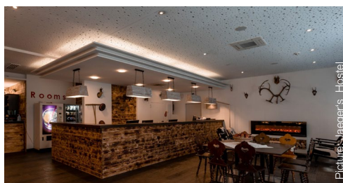
Jaeger's Hostel Munich Center