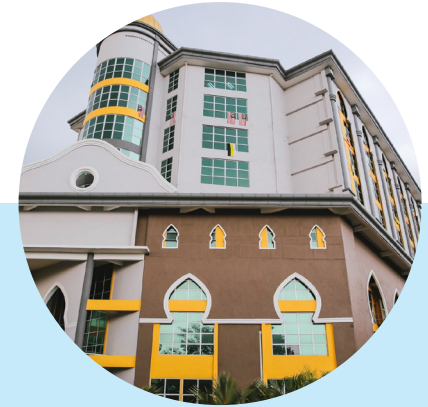
UniKL Royal College of Medicine Perak (UniKL RCMP)

Specialization Marine Engineering Technology