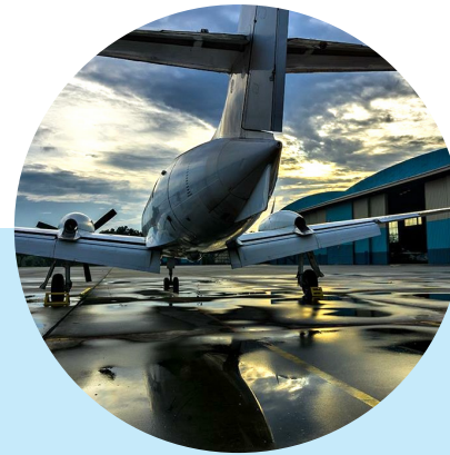
UniKL Malaysian Institute of Aviation Technology (UniKL MIAT)

Electrical, Electronics & Telecommunication Technology