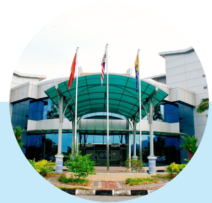
UniKL Malaysian Spanish Institute (UniKL MSI)

Aviation & Aircraft Maintenance Technology