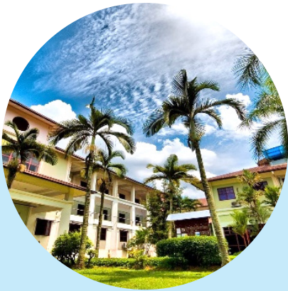
UniKL Malaysia France Institute (UniKL MFI)

Seksyen 14, Jalan Teras Jernang, 43650 Bandar Baru Bangi, Selangor