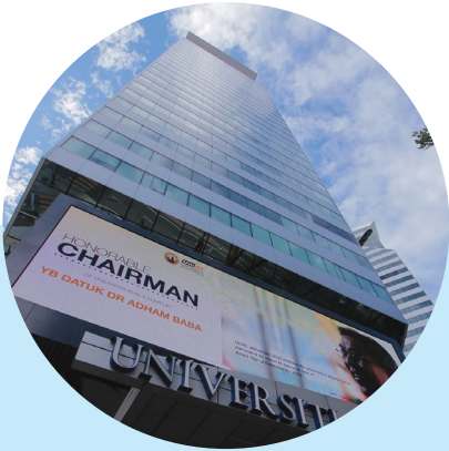
UniKL Malaysian Institute of Information Technology (UniKL MIIT)

1016, Jalan Sultan Ismail, 50250 Kuala Lumpur