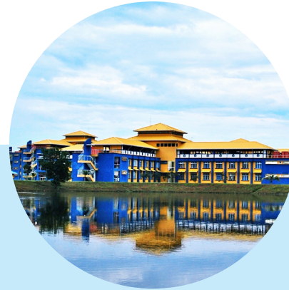
UniKL Malaysian Institute of Marine Engineering Technology (UniKL MIMET)

Specialization Chemical & Bioengineering Technology