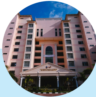
UniKL British Malaysian Institute (BMI)

Industrial Maintenance & Automation Technology